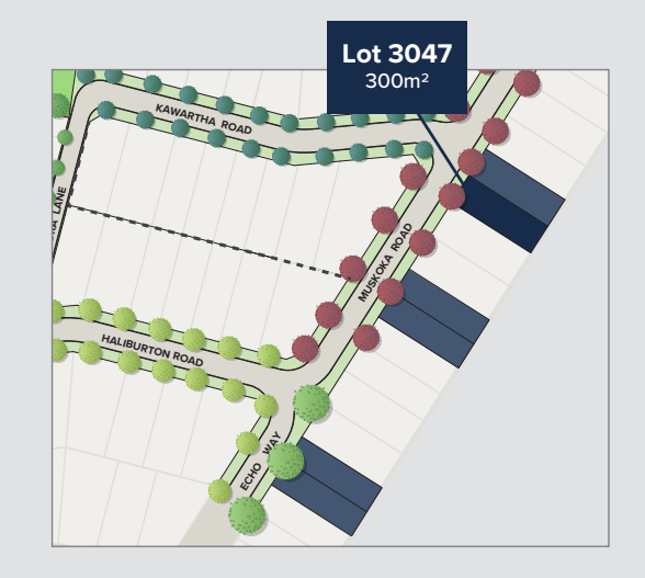
All dimensions and room sizes are approximate and may not be to scale. Plans and elevations are for illustration purposes only.